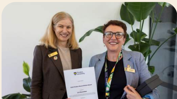
Receiving a RAP Award for inclusion and cultural respect

The Library was recognised for its contribution to inclusion and cultural respect with a Reconciliation Action Plan Award , for initiatives that support culturally safe and inclusive spaces for Aboriginal and Torres Strait Islander students, including Kaurna language signage and inclusive design elements across Library branches.