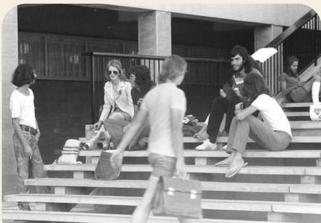
Library spaces supporting generations of students

In 2026, the Library will celebrate 60 years of service, marking a long-standing commitment to supporting learning and research while continuing to adapt to the needs of future generations.