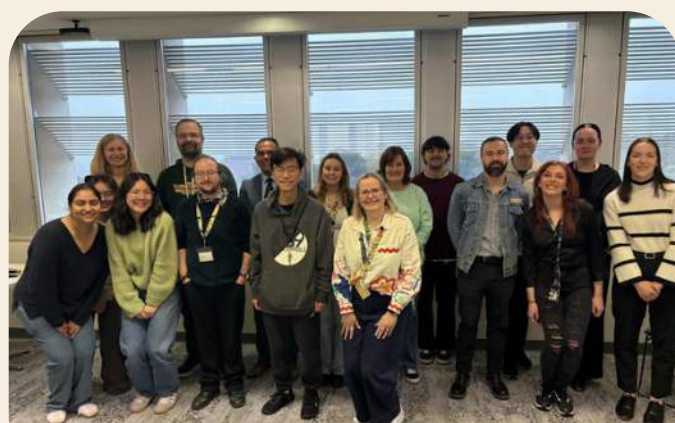
Student Library Officers supporting a welcoming campus environment

Student Library Officers play a key role in creating a welcoming and supportive environment across all campuses.