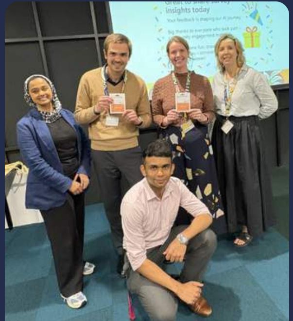
Building staff capability through AI professional development programs

Staff presented at forums including Clarivate ANZ, ALIA Information Online, and THETA, contributing to sector discussions and sharing practical approaches to safe and effective AI use.