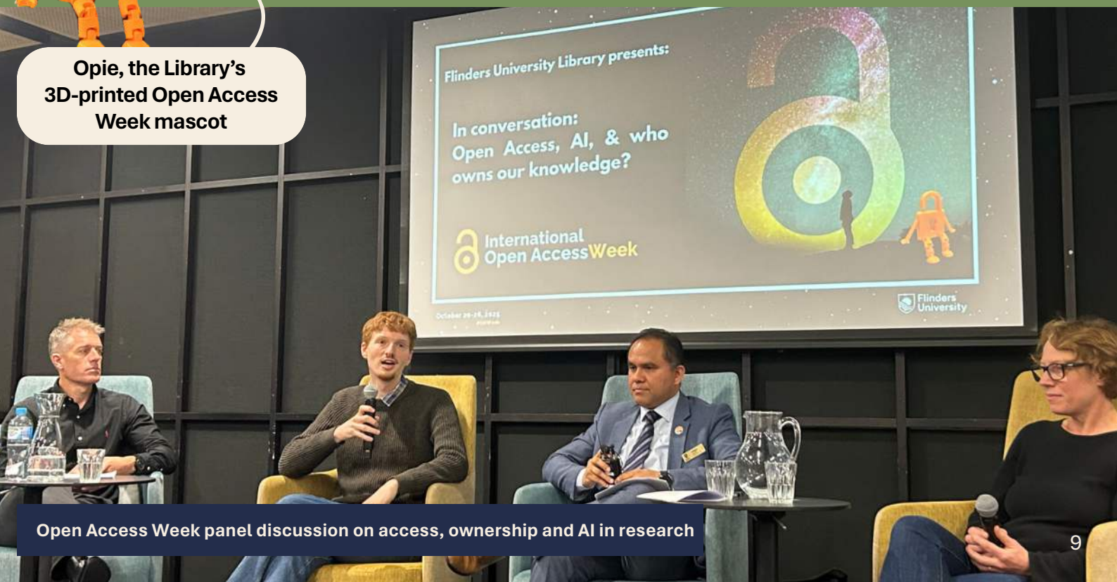
Open Access Week panel discussion on access, ownership and AI in research