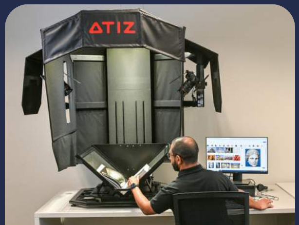
Digitising and managing institutional records across the University

This work has strengthened the reliability of institutional information, supporting more confident reporting and decisions.