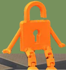
Opie, the Library's 3D-printed Open Access Week mascot