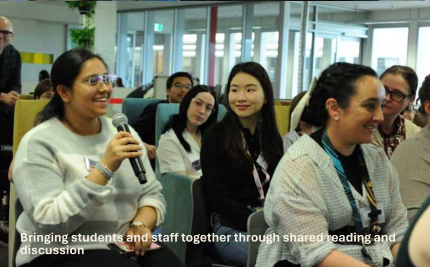
Bringing students and staff together through shared reading and discussion