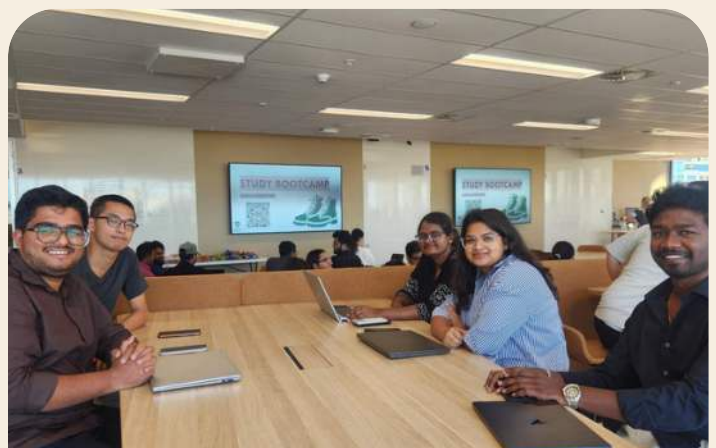
Building student capability through Study Bootcamp

Study Bootcamp , delivered in partnership with Student Learning Support Service and International Student Services, provided intensive workshops on academic writing, literature searching and ethical use of AI during mid semester breaks.