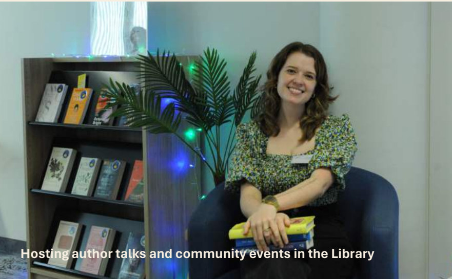
Hosting author talks and community events in the Library

The Library is more than a place to study. In 2025, it strengthened its role as a visible and active part of campus life, creating opportunities to connect through programs, exhibitions and shared experiences.