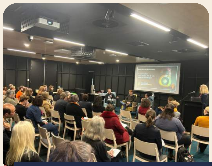
Engaging researchers and staff through Open Access Week events

During Open Access Week , the Library's Open Access panel also engaged more than 140 researchers and staff in discussion on access, ownership and the impact of artificial intelligence in research.