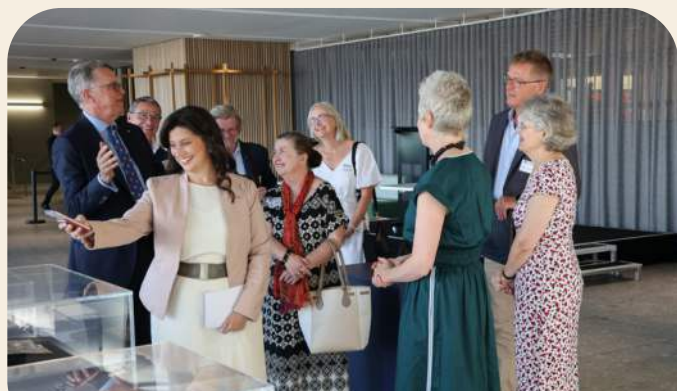
Opening of Matthew Flinders: Fearless in Life, Love, and Tragedy.

Exhibitions and displays across Library branches brought research, history and culture into everyday campus spaces.