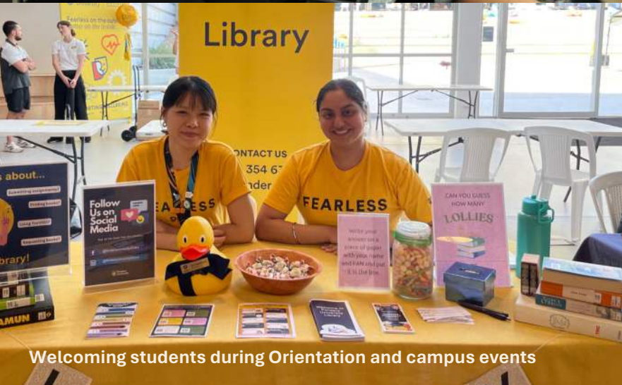
Welcoming students during Orientation and campus events