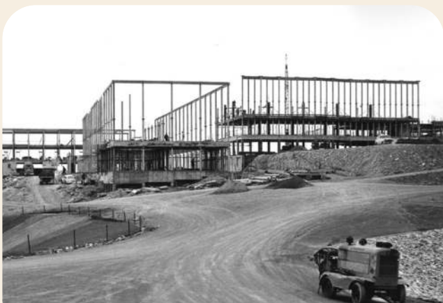
Developing Library spaces to support future learning