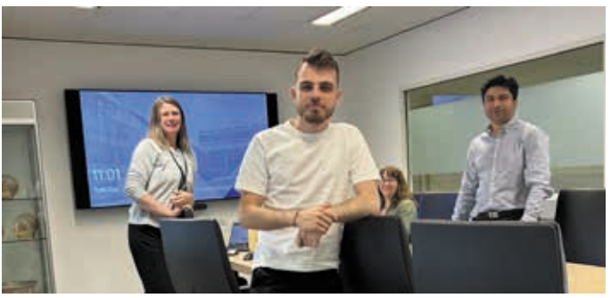
Our team invited more than 35 students to work alongside us to learn about Library operations and become Library ambassadors. They developed their skills in roles as Student Library Officers, Student Library Assistants, Work Integrated Learning (WIL) participants, Indigenous cadets, and work experience students.